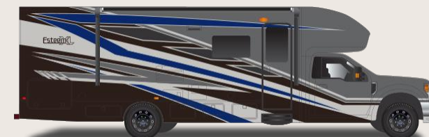
Night Shade Full-Body Paint