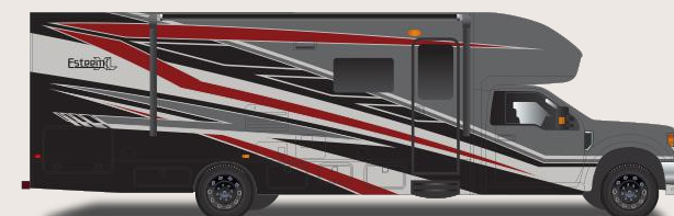
Harvest Night Full-Body Paint