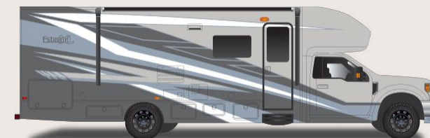
Summer Equinox Full-Body Paint