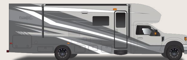
Winter Sky Full-Body Paint