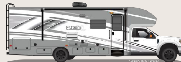
Standard Partial Paint